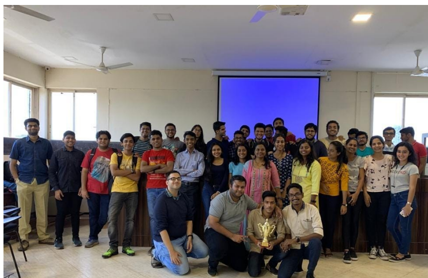
The winning team with the entire EBSB Committee of TSEC